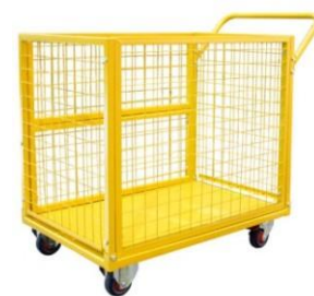
2 Tier 900 x 600mm Stock Picking Trolley with Mesh Top (PFR134)