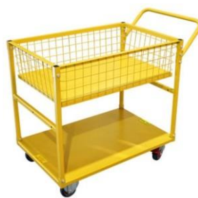
900 x 600mm Full Mesh Stock Picking Trolley