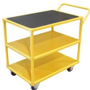
3 Tier 900 x 600mm Platform Trolley